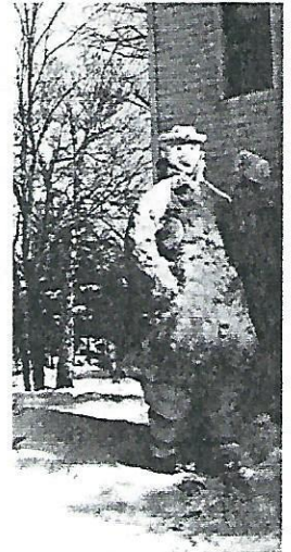
Snow Sculpture Winter Carnival 1947

Join us for some refreshments and visit our new exhibit titled "Winter Wonderland". Share with us your memories of how folks in the North Woods enjoyed the long, snowy, winter months years ago. Our exhibit features a history of our winter sports such as skiing, tobogganing, skip-jacks, ice skating, dog sled rides, snow sculpturing and sleigh riding. We have great photos and stories about Winter Carnivals, Ice Castles, Snow Trains, the Polar Bear Club and Olympians.. If you ever packed a snowball, or strapped on a pair of snowshoes – or just simply enjoyed the beauty and serenity of a winter scene, you will love this exhibit!