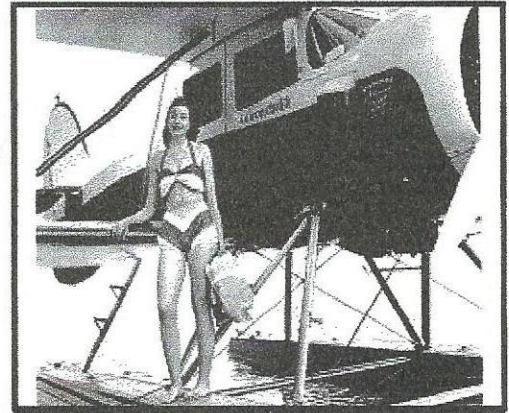
Windhusen's Air Service in Eagle Bay