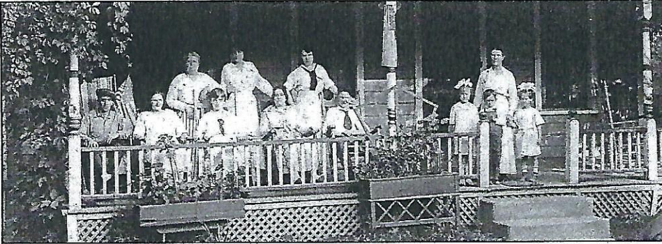
Forest House Twins on the Porch in 1916