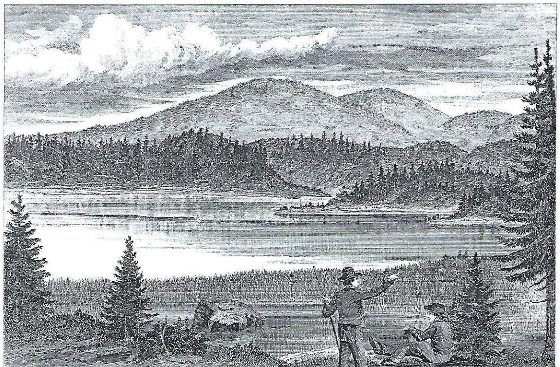
Plate No 19.