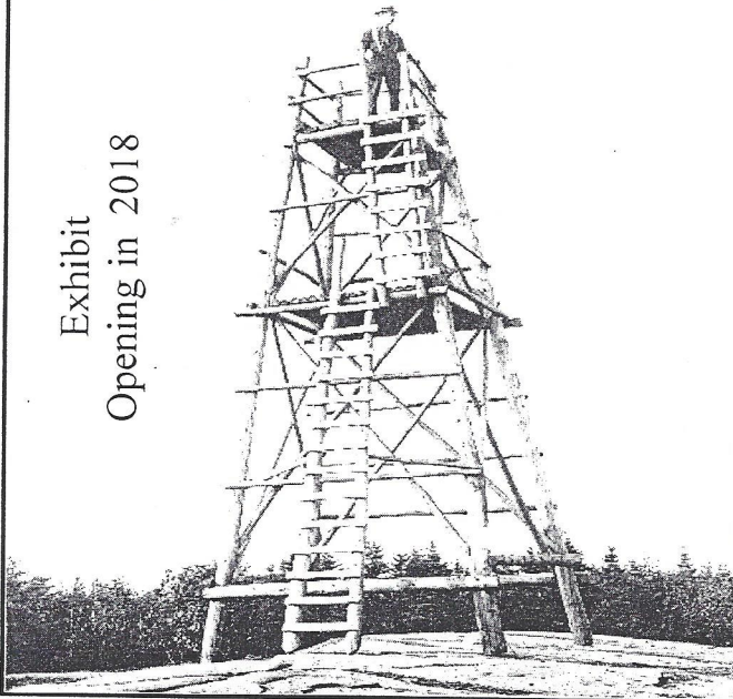
Exhibit Opening in 2018