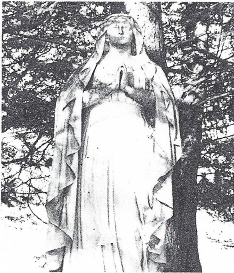
2008 photo at Camp Nazareth Our Lady of the Woods Statue

ago, "Our Lady of the Woods," still stands today under the lakeshore pine trees.